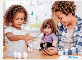
5 Lead Teachers