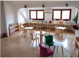
Open 10 Hours/Day