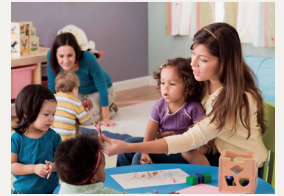
4 Assistant Teachers

...where parents pay an average of $10,000 per child annually.